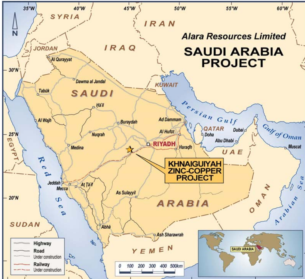
Figure 1: Project Location Map Within Saudi Arabia

The Project is located on a bitumen road ~170km west of Riyadh, the capital of Saudi Arabia near the major Riyadh to Jeddah highway.